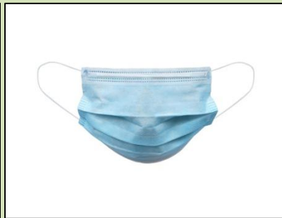
always wear mask